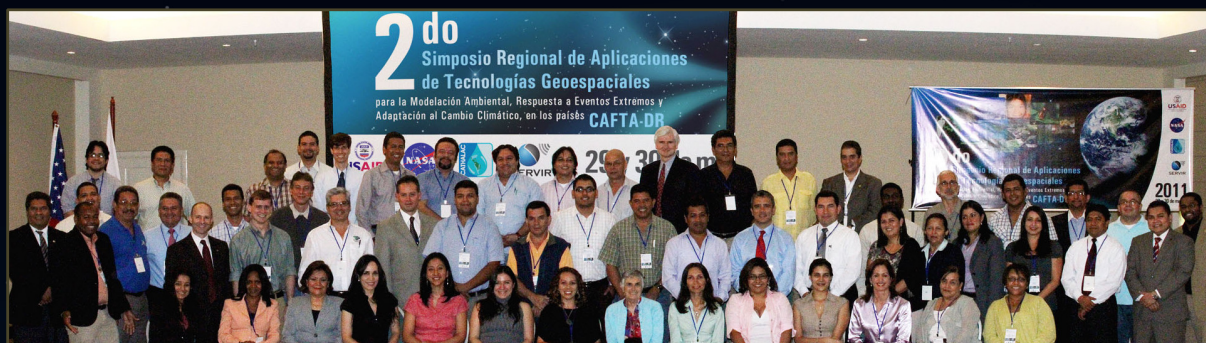
2 nd Regional Geospatial Technology Application Symposium, 2010