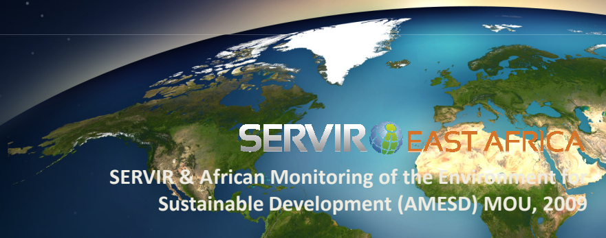
SERVIR & African Monitoring of the Environment for Sustainable Development (AMESD) MOU, 2009